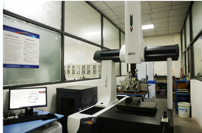
3D COORDINATE DETECTOR